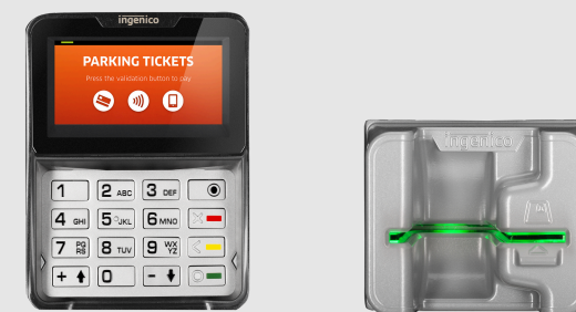
SELF MODULAR SERIES