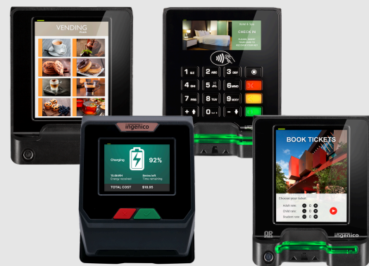
SELF ALL-IN-ONE SERIES